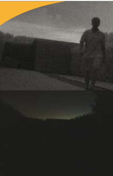
Top: night vision VISNIR Bottom: night vision visual