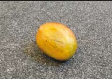
Top: fruit inspection infrared Bottom: fruit inspection visual