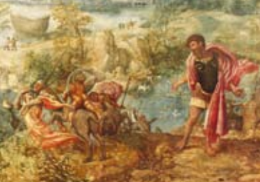
Top: art inspection infrared Bottom: art inspection visual